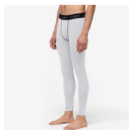
Eastbay EVAPOR Core Compression