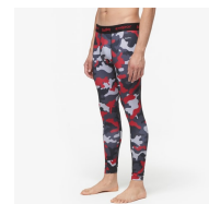
Eastbay EVAPOR Core Compression