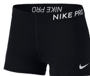
Nike Pro 3" Compression Shorts - Women's