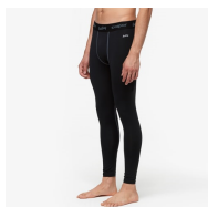
Eastbay EVAPOR Core Compression