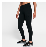
Nike Power Training Tights - Women's